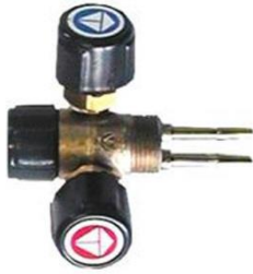
Valve shaft MINITHERM