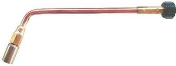
Heating Insert MINITHERM ZD 8/2 PM