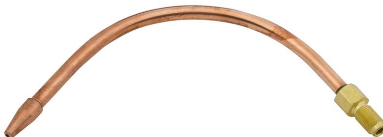
Flexible nozzle MINITHERM Z-A