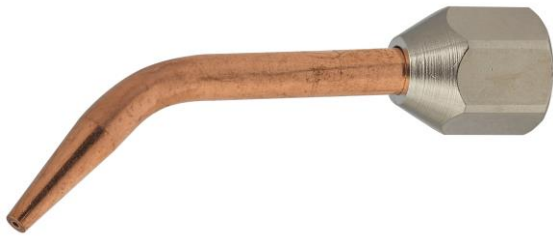
Micro insert MINITHERM