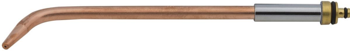
Heating Insert MINITHERM Z-A