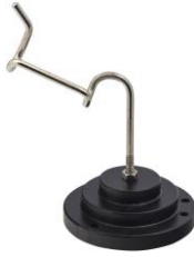
Table torch holder MINITHERM