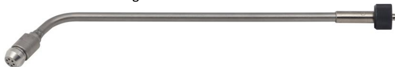
Heating Insert MINITHERM FK-PMY 6