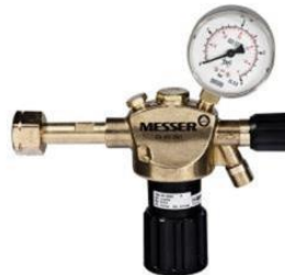
Cylinder pressure regulator CONSTANT Propane