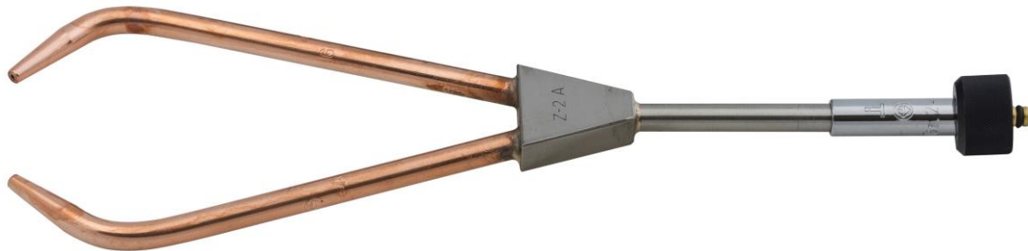
Forked torch MINITHERM Z-PMYE und Z-AH