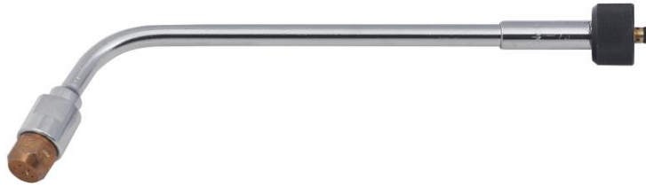
Heating Insert MINITHERM FKZ-AH