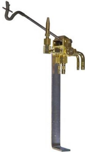
Mechanical gas economiser