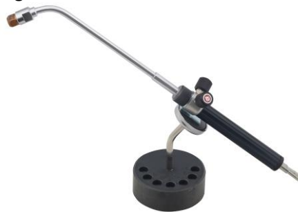
Magnetic table torch holder MINITHERM