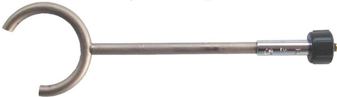
Ring torch MINITHERM type C