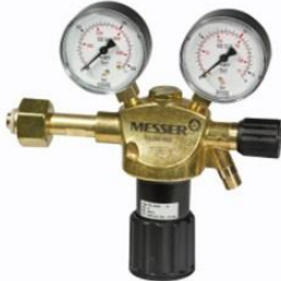
Cylinder pressure regulator CONSTANT Oxygen