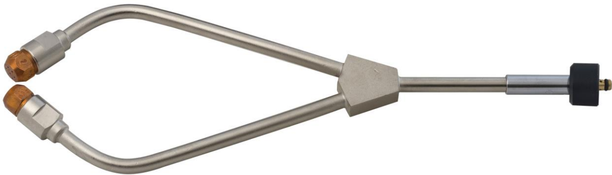
Forked torch MINITHERM FKZ-PMY