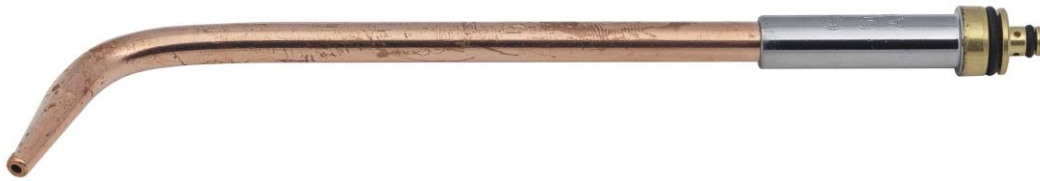
Heating insert MINITHERM Z-PM