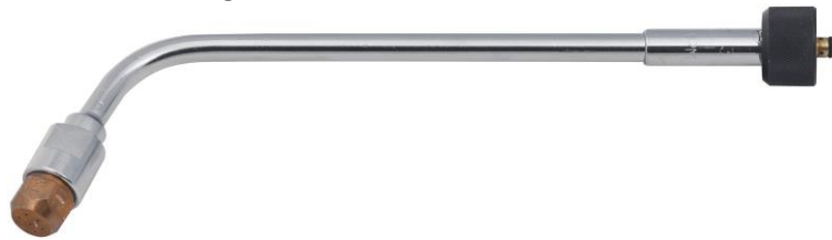
Heating Insert MINITHERM FKZ-PMY 1 and 2